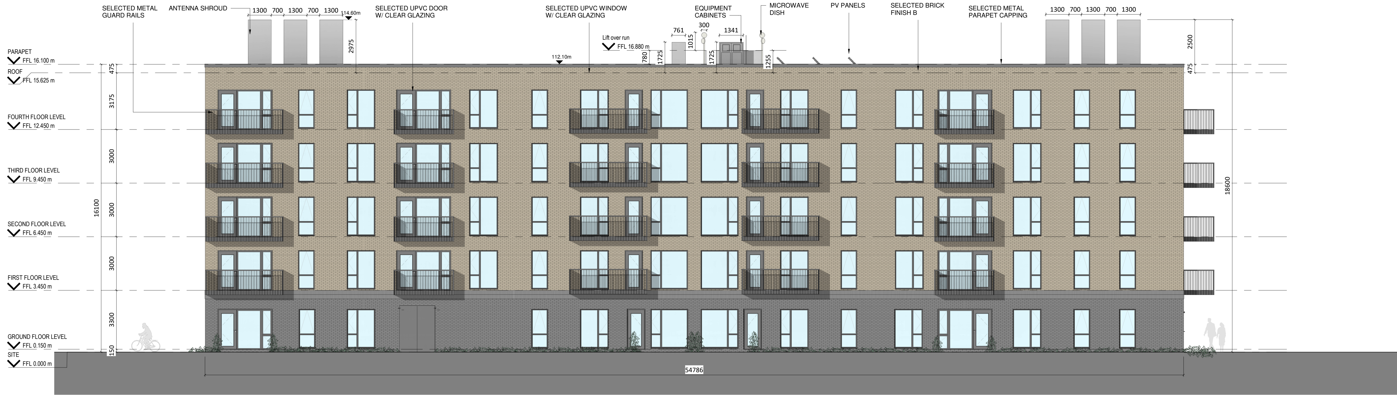
1 BLOCK B - WEST ELEVATION 1 : 100