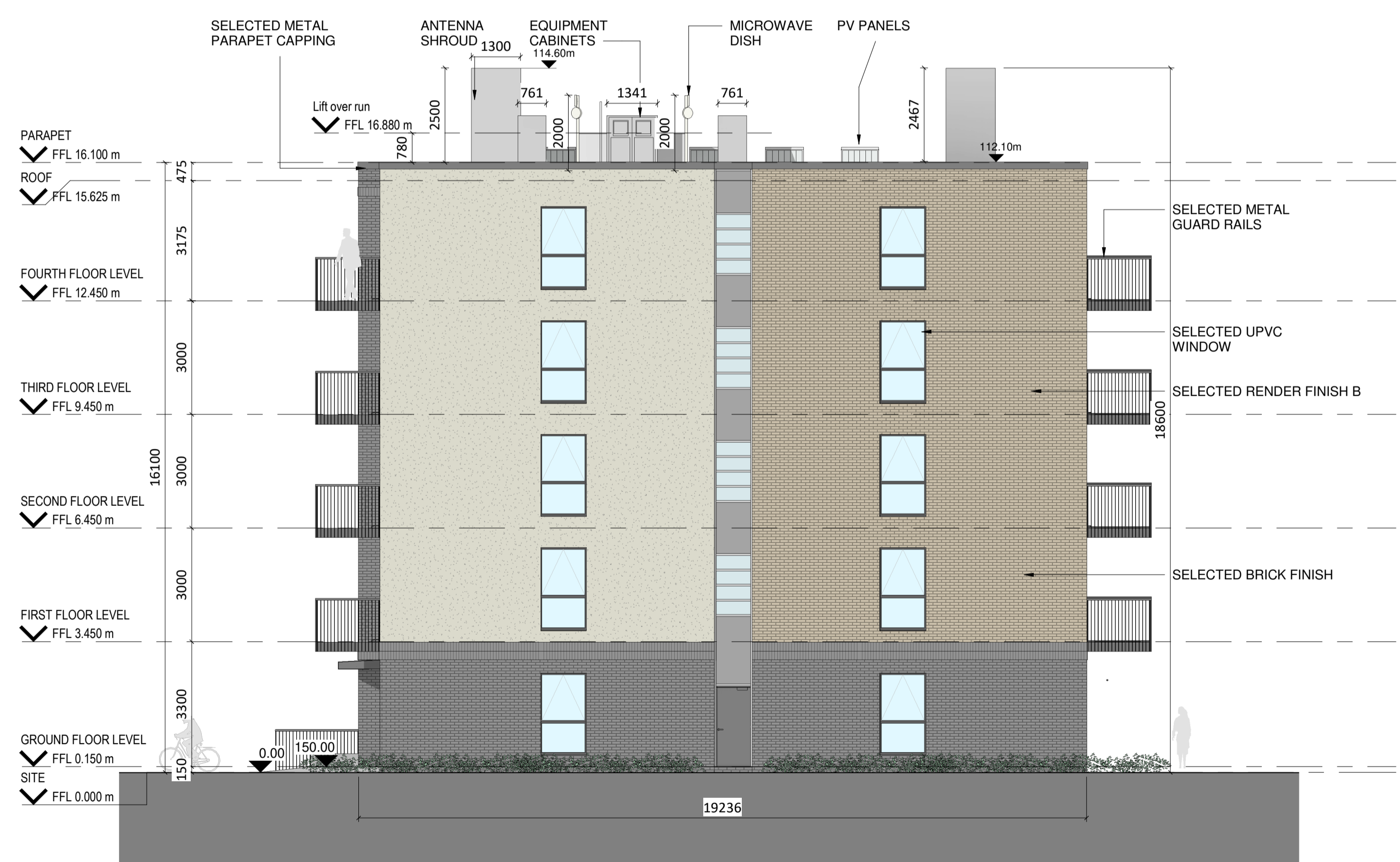
3 BLOCK B - NORTH ELEVATION 1 : 100