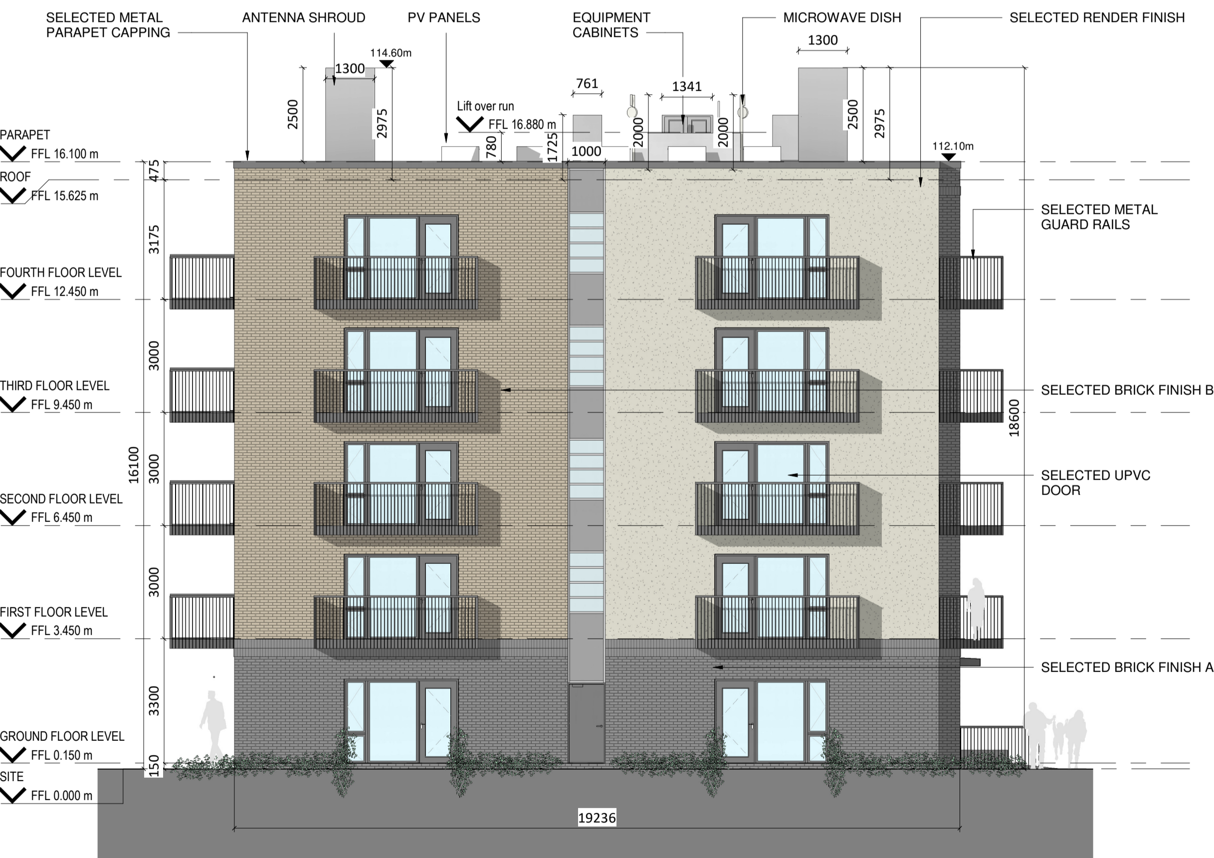
2 BLOCK B - SOUTH ELEVATION 1 : 100